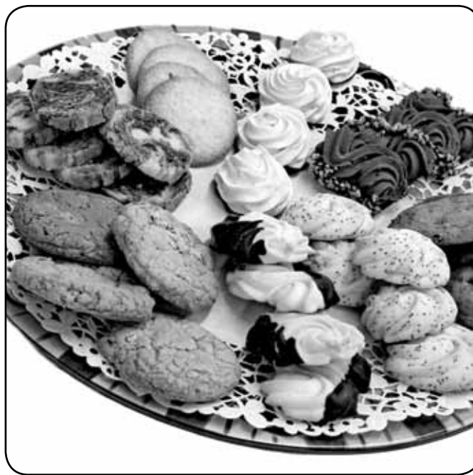
There will be many treats to choose from

Join the WHC Auxiliary for their yearly Fall Food Fair. It will take place at 9 a.m. on Thursday, November 17, at the WHC Green Entrance.