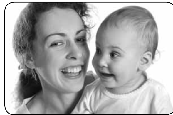
Learn the facts about diabetes and your pregnancy