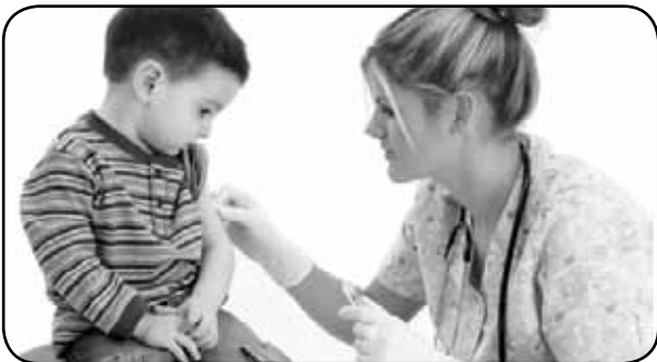
The best way to help prevent the flu is to get a flu shot

Flu season is just around the corner. Here are a few tips to help you and your family stay healthy this year.