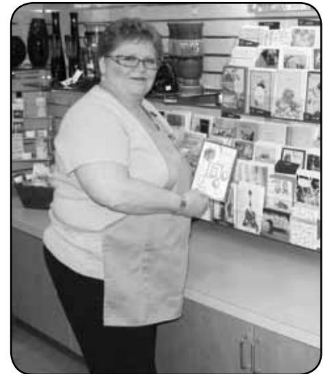
A volunteer stocks greeting cards in the Gift Garden

Attendees may park in the Red Lot and enter through the Tendrils Rooftop Garden event entrance, located south of the Center Pharmacy drive-up. To learn more, contact Laurie Everhardt at (319) 483-4076.