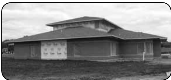
The new Shell Rock Clinic building as of September 2011

The Shell Rock Clinic is making plans to open this winter. Construction started last June for the 8,600 square foot building. When finished, there will be room for four health care providers.